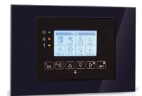
Latest generation control panel.